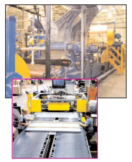
Photo's of some of the machinery on the production line at the Therma-Tru manufacturing plant - one of the largest in the world.

Wholesale Building Materials hosted a trip to the Therma-Tru factory in January. Dealers, their key customers, and some of our employees were invited to make the trip and tour one of the largest exterior door manufacturing facilities in the world. When they arrived on Wednesday, they were taken to the Auburn Inn and there they