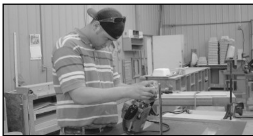
Precision cuts are made with a lazer saw - there is no room for error.