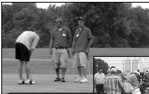
Beginner or pro - made no difference - a good time was had by all!!!!

This will be the 8th annual outing - and each year the participation tends to grow. This is a fun day, and our way of showing our contractors that we appreciate their business. Many of our key vendors attend, and this gives them both an opportunity to meet and learn more about each others business needs.