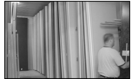
Over 1,000 laminite slabs in stock at the Top Shop