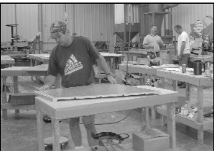
Top Shop craftsmen at work producing custom made counter tops.

The new undermount method of attaching a - Karran solid surface sink to laminite gives the appearance of a seamless one-piece top.