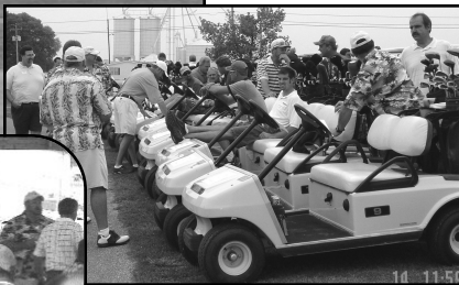
Golfers enjoying dinner after a hard day on the golf course!