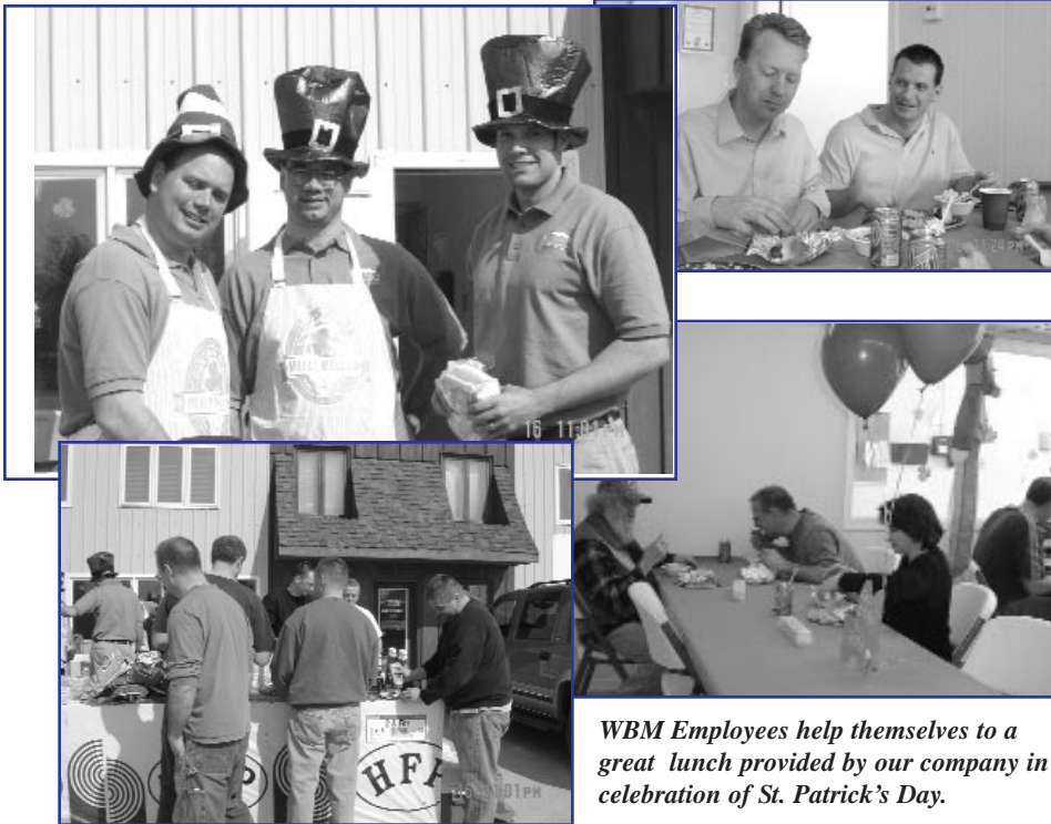
WBM Employees help themselves to a great lunch provided by our company in celebration of St. Patrick's Day.