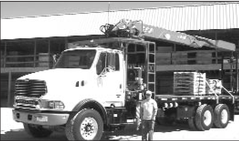
Shown above is John Wallace, Niehaus driver, with the new Mercedes Boom Truck loaded with roofing that will be lifted off by the pallet when it reaches its destination.

Niehaus Home Center recently purchased a new Sterling Boom Truck. The new truck replaces one that had acquired some age and many miles. The boom truck is a necessary aid in delivering big loads like drywall, trusses and roofing. The crane-like boom can pick up full pallets and swing it off the truck and place the load almost anywhere - ground level or upper levels - like second story or roof. It takes a skilled driver to manoeuvre the load safely. The capabilities of the truck also saves many man-hours in loading and unloading materials.